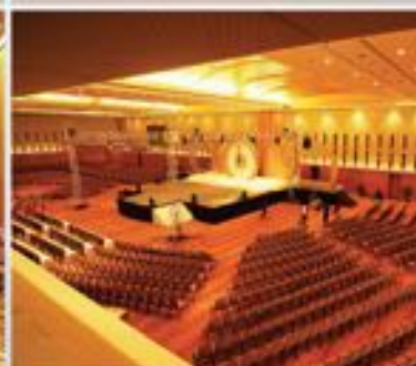
• Hall 2 Town Hall