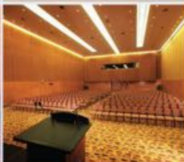
• Hall 3 Stage