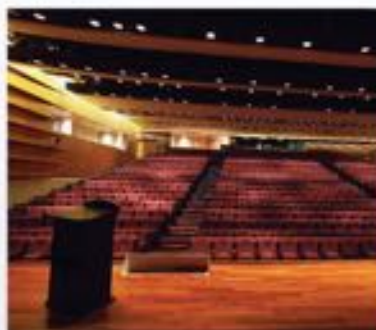
• Plenary Theater