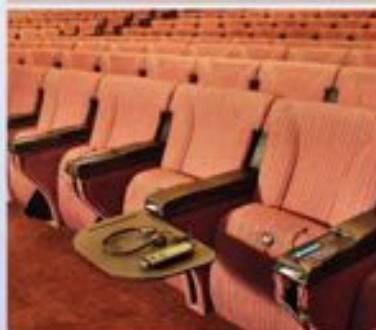
• Plenary Theater